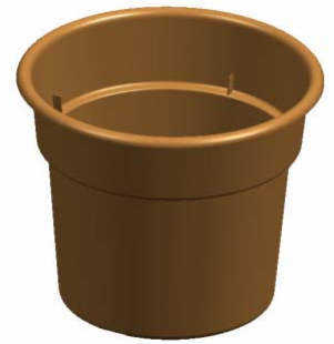
8" - 10" - 12" sizes

The patio pot has a slightly larger volume than the planter pot and is impressive anywhere plant color and beauty is required.